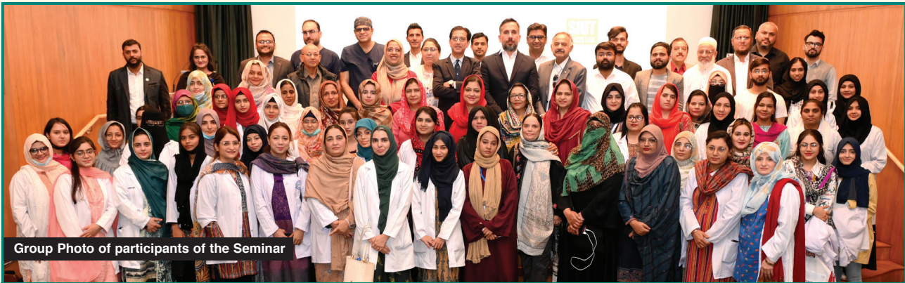
Group Photo of participants of the Seminar